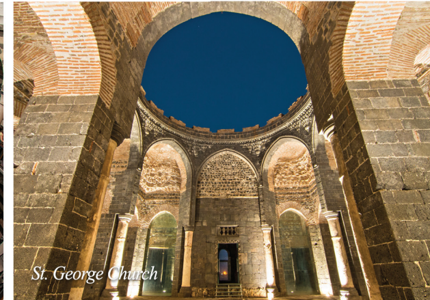
St. George Church