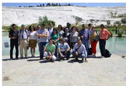
Trip to Pamukkale