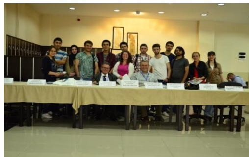
Erasmus Study Fair