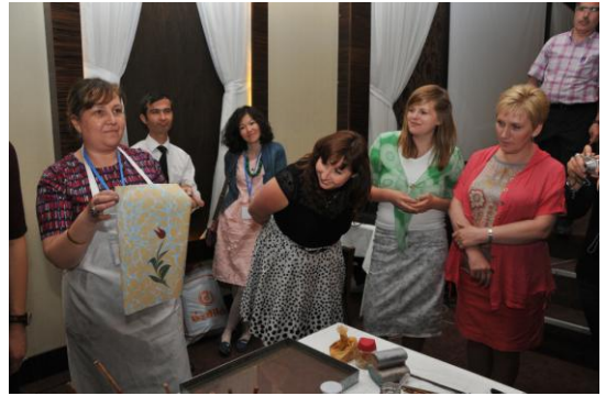
The Art of Ebru (Turkish Art)