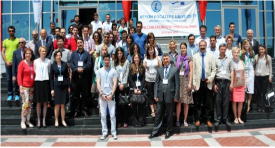
Atatürk Congress Center

Approximately 30 Participants from: Italy, Germany, Greece, Spain, Romania, Czech Republic, Poland, Estonia, France