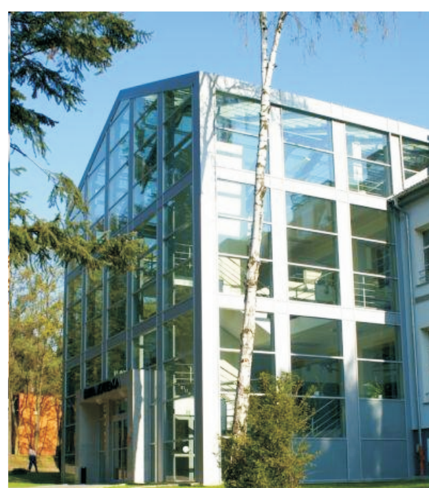
KARKONOSZE COLLEGE IN JELENIA GÓRA