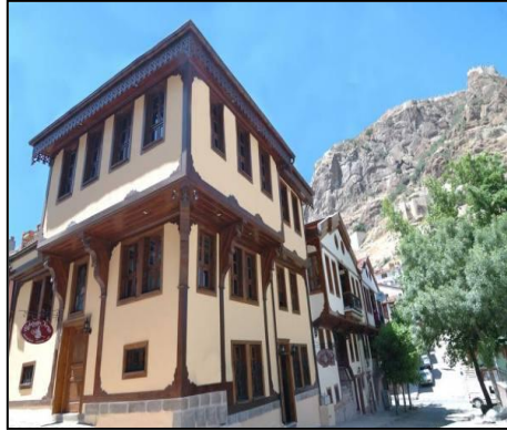
Afyon Castle ve Houses