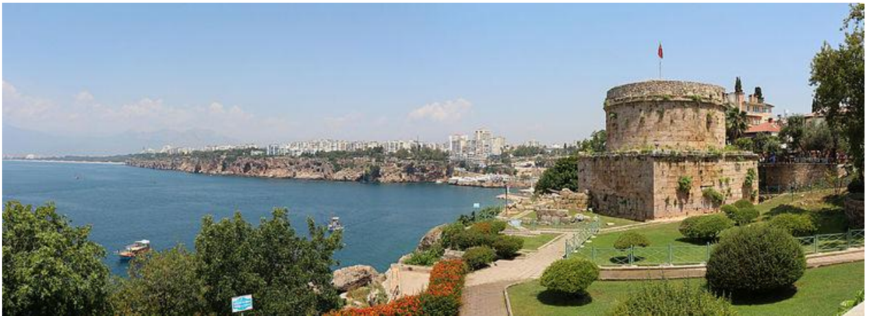
A panoramic view from Karaalioğlu Park with Historic Hıdırlık Tower.