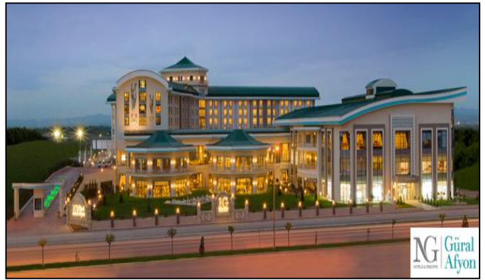
NG Güral Afyon