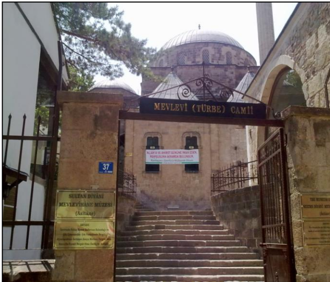
Mevlevi Türbe Mosque

As a recreation area, Akarçay is famous place for strolling and boat tours can be done.