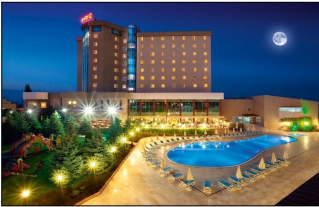
İkbal Thermal Otel

Other Hotels: Çakmak Marble Otel (4 Star), Oruçoğlu Oreko Otel (These are in the city center.)