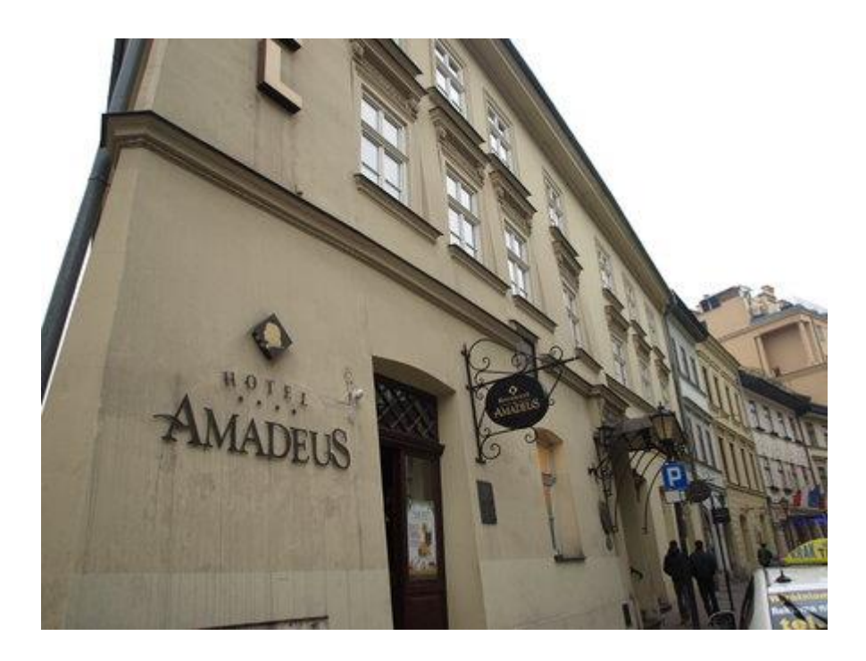
12) Hotel Amadeus ****