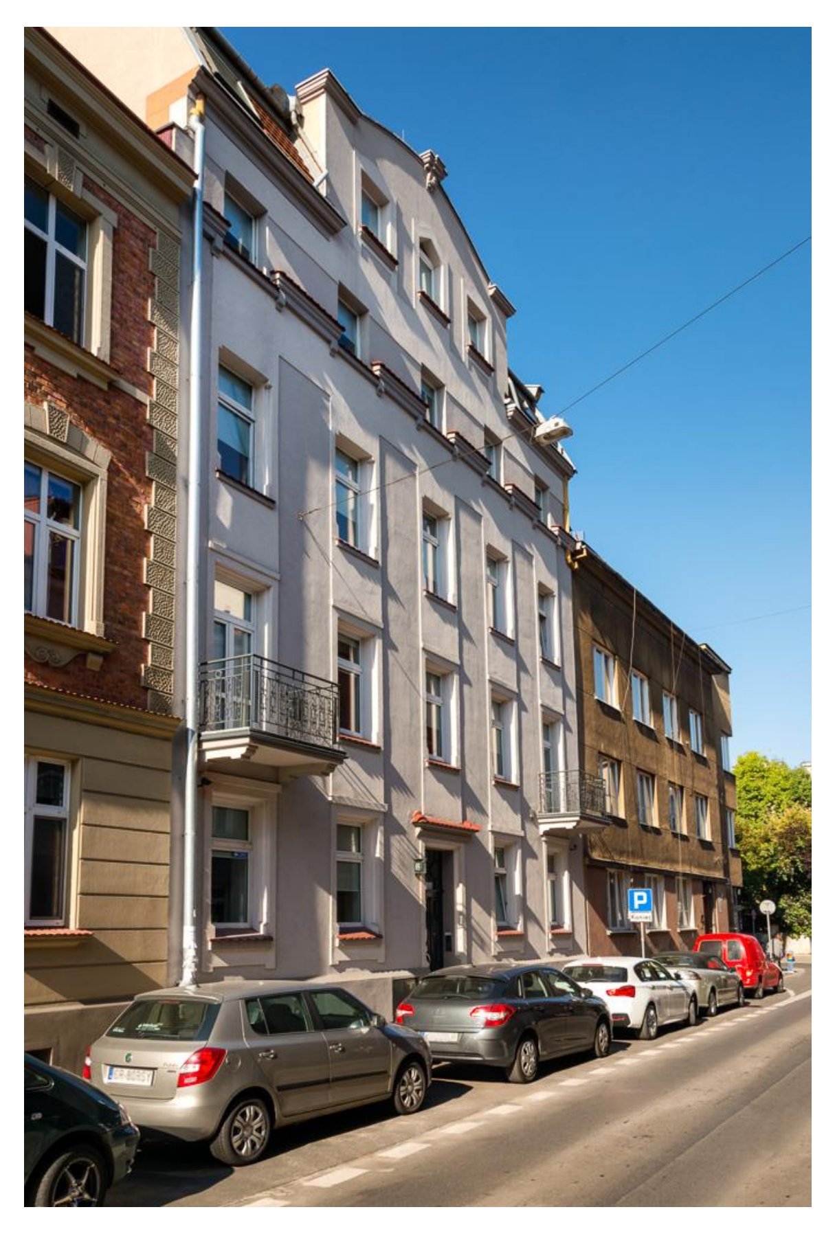
4) Emaus Apartments: